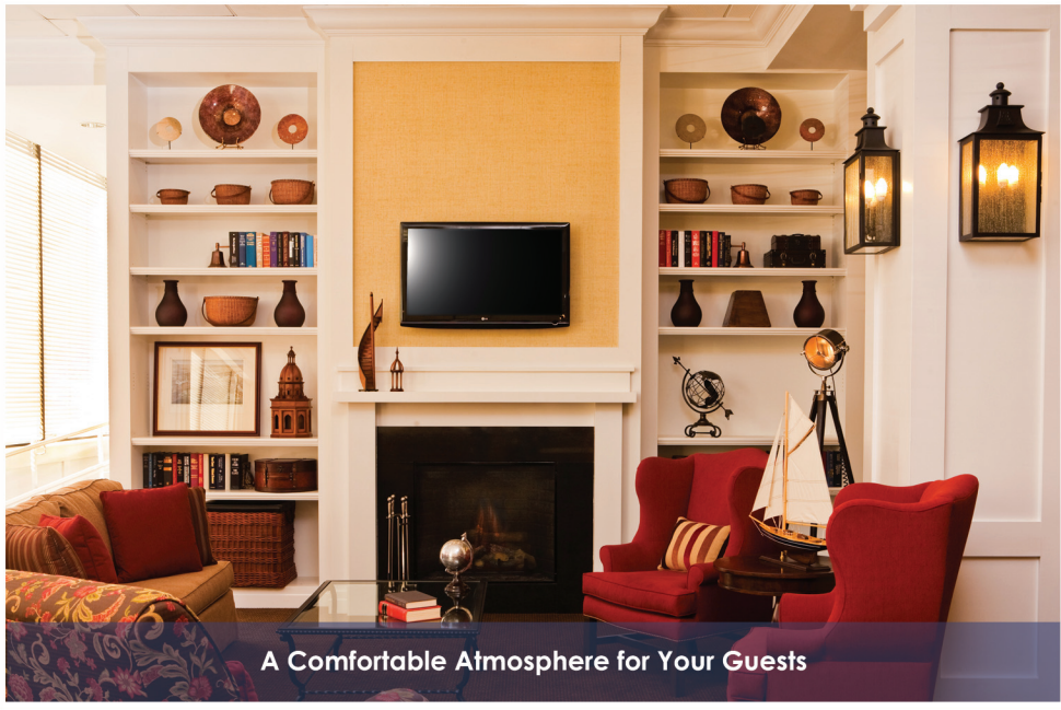
A Comfortable Atmosphere for Your Guests