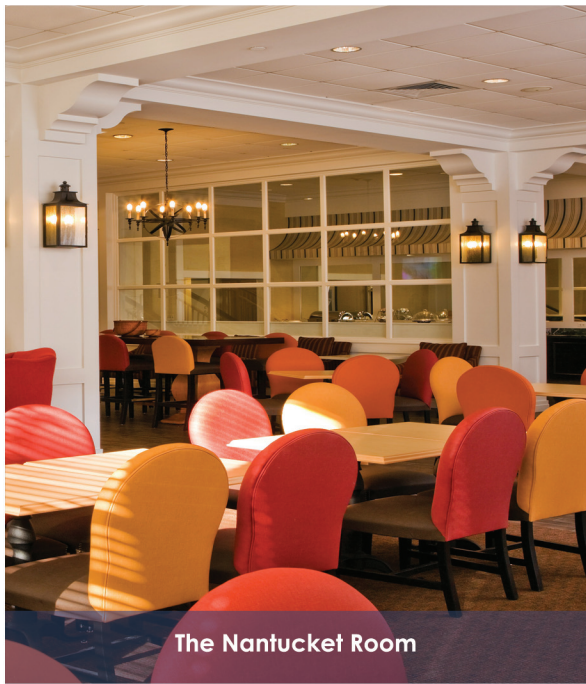
The Nantucket Room